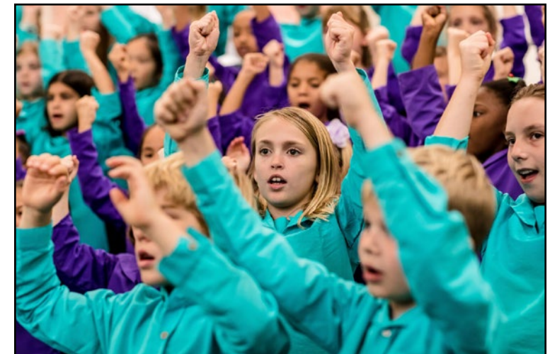
The YouTube premiere of the Kinder & Training Dept. Winter Recital will be on Saturday, December 5 at 4 p.m.

Celebrate the start of a new year with the Piedmont East Bay Children's Choir family. From the youngest Training Department musicians to the mature and seasoned performances of Concert Choir and Ensemble, this performance connects all of the ensembles in an inspiring showcase of the progressive musical growth and artistry of our singers.